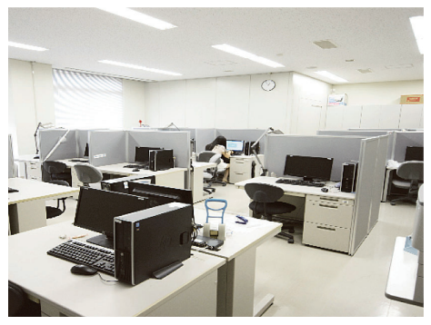
Computing facility of IMS