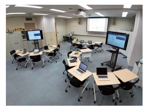
Seminar studio of IMS